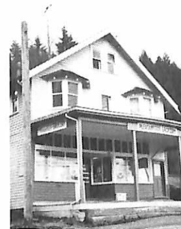
Pleasantide Store - Ioco Road

On the scenic north shore, it is the subject of many artists' renderings. It has appeal for its character and lack of change. You may have seen this charming store on television or in movies. Carry on down the road to Belcarra Park, Sasamat Lake, White Pine Beach, or Buntzen Lake.