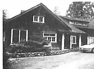
Anmore Village Admin.Ctre. 2690 Sunnyside Road