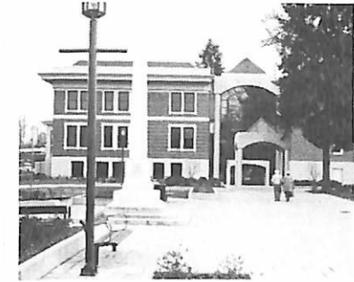
Port Coquitlam City Hall

Located at the corner of Shaughnessy Street and McAllister Avenue, it was recently remodelled for the 75th Anniversary of the city. New mingles with old to create an innovative style.