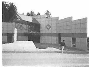
Poirier Street Library - 565 Poirier Street

The library opened in March 1989 for the benefit of Coquitlam residents. Interesting in design, it is also the home of exhibits of various kinds.