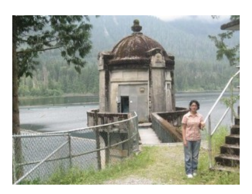
Coquitlam Watershed Tour