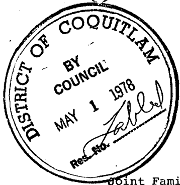
Table - Exec