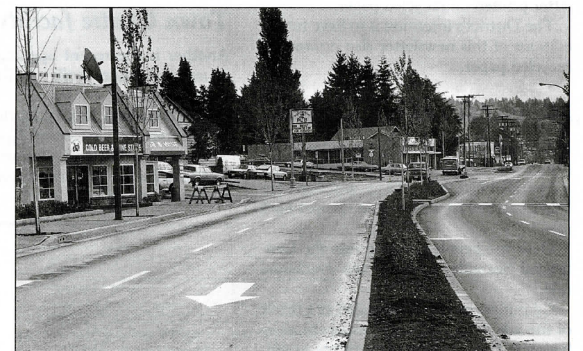
Maillardville revitalization . . . unsightly overhead wires removed, Brunette Avenue widened, parking added