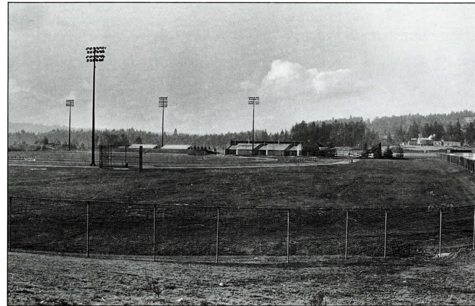
Town Centre Stadium, playing fields taking shape