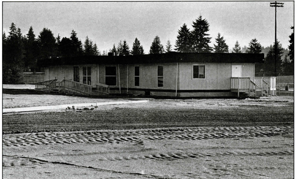
New Town Centre Recreation facility

Coquitlam realized $6,871,500 as a result of the sale. And the purchasers went away happy to have had the opportunity to purchase a building lot in Coquitlam.